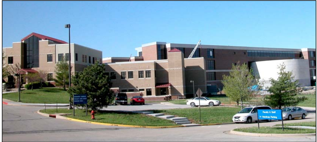
KU Edwards Campus