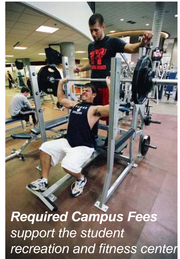
Required Campus Fees support the student recreation and fitness center